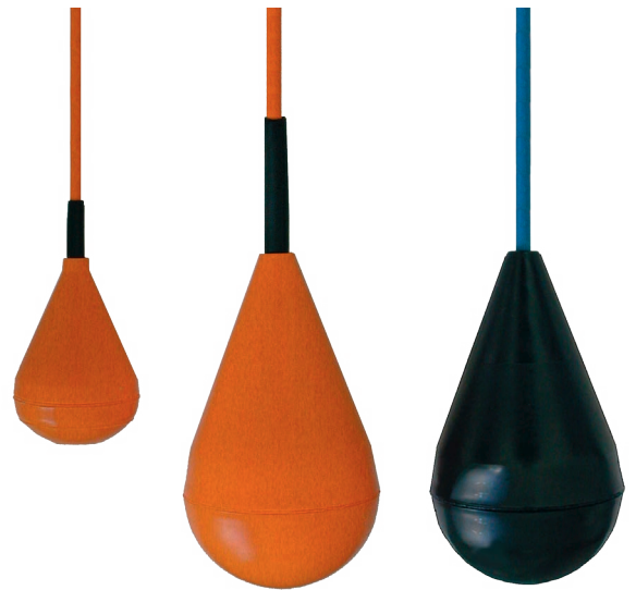
Fig. left: Model SLS-M2