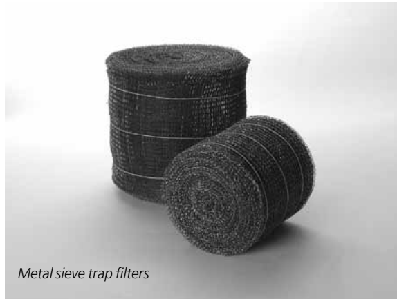
Metal sieve trap filters