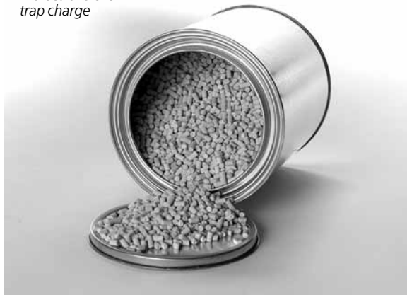
Molecular sieve trap charge